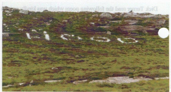
The Hood Stones