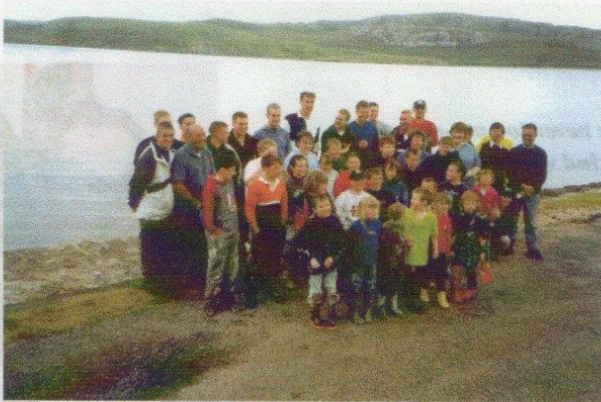
Crewmembers of HMS Sutherland, Children and Staff who maintain the Hood Stones