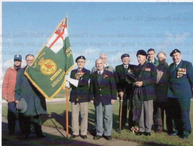
Association members at Southsea. 11 th September 2002