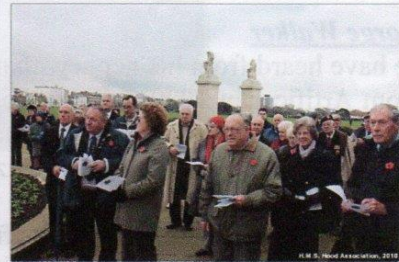
Members of the Association