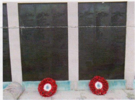
Memorial Plaques of HMS Hood