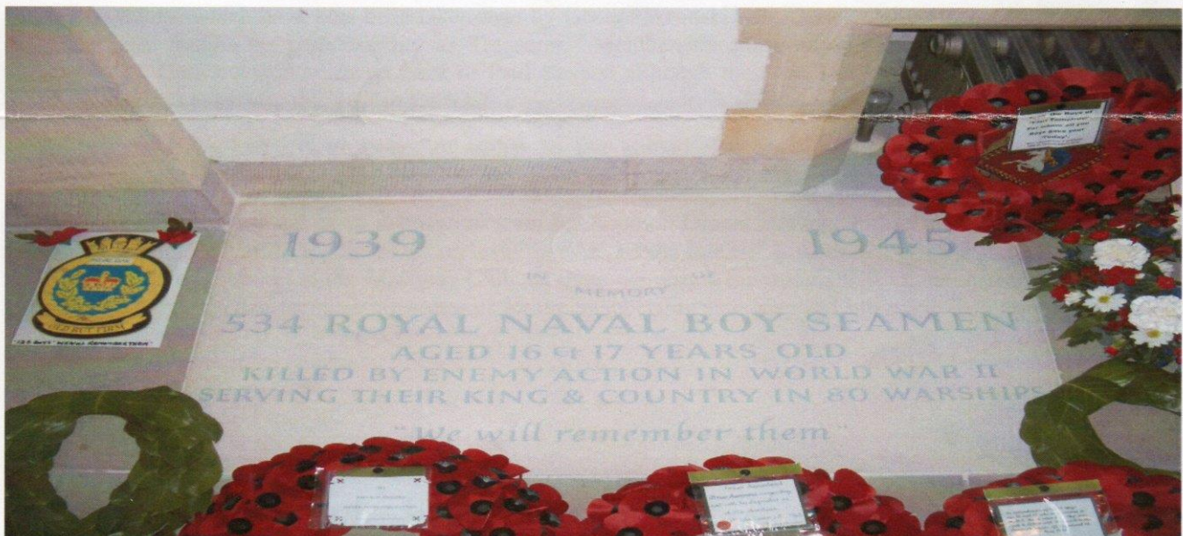
Memorial Stone Hood's wreath bottom right hand corner