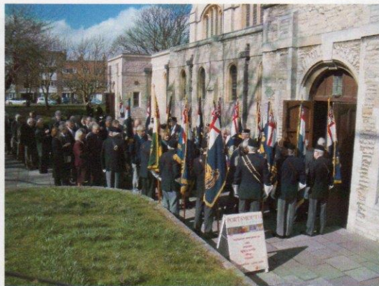
Standards Lining entrance to Cathedral