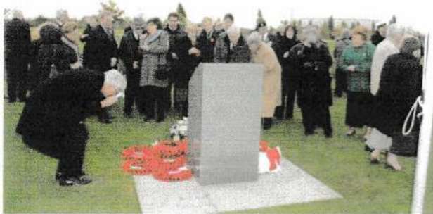
Members viewing the Memorial Stone