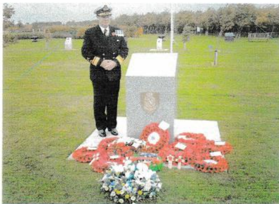
Rear Admiral Wilcocks after the Dedication Ceremony

H.M.S. HOOD SUNK IN ACTION WITH THE GERMAN BATTLESHIP BISMARCK IN THE DENMARK STRAIT OFF GREENLAND ON 24 TH MAY 1941 IN MEMORY OF THE 1415 OFFICERS AND RATINGS WHO DIED INCLUDING 24 COMMONWEALTH, 4 POLISH MIDSHIPMEN AND 5 FREE FRENCH SAILORS. OF THE SHIP'S COMPANY ONLY 3 SURVIVED. DEDICATED IN 2008 BY H.M.S. HOOD ASSOCIATION