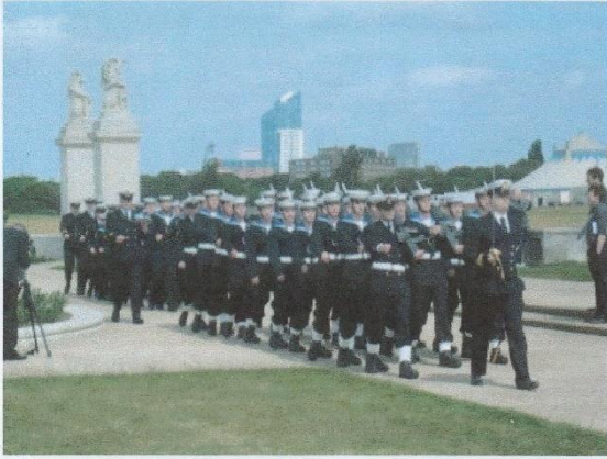
HMS Collingwood Guard & Marching Platoon