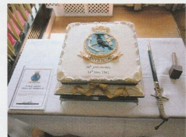
Cake & Roll of Honour