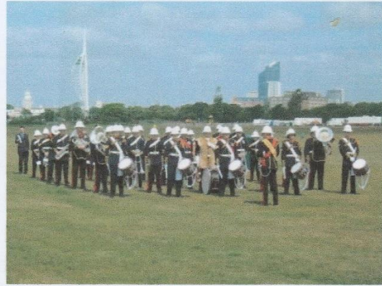
HMS Collingwood Royal Marine Band