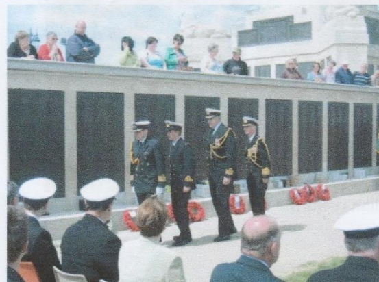
Naval Representatives Poland, New Zealand, Canada & Australia