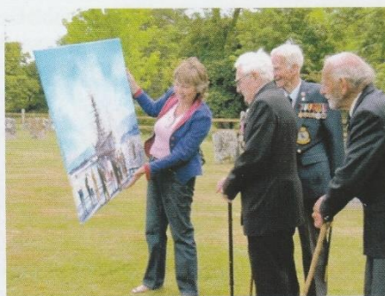
Veterans Viewing the Picture