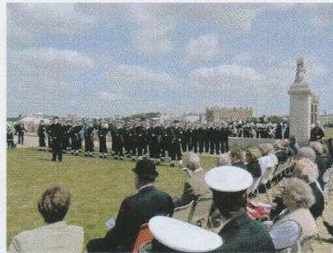
HMS Collingwood's Guard, Band & Marching Platoon