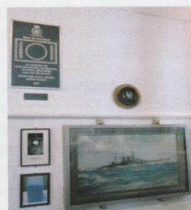
H.M.S. Hood corner