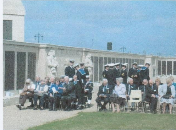
Members seated for the service