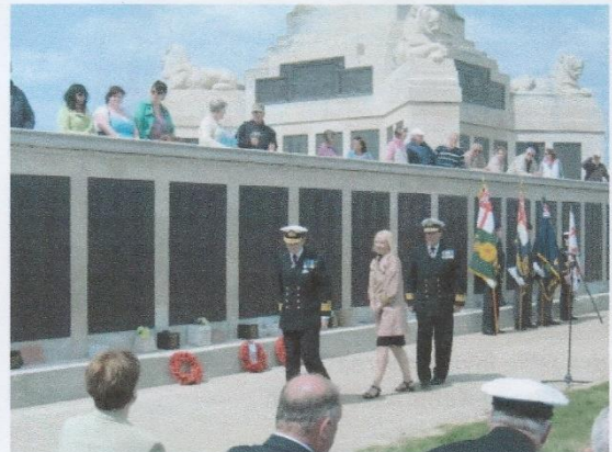
L-R Rear Admiral Steel, Lord Mayor Portsmouth Cheryl Buggy, Rear Admiral Wilcocks