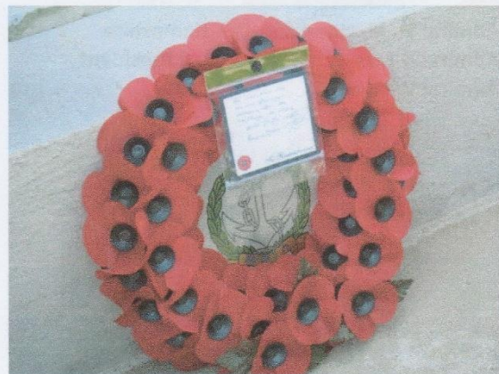
MAY THEY REST IN PEACE