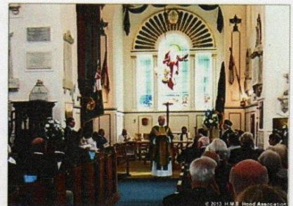
Inside Saint Ann's with standards raised HMS Hood on the Left and WRENS Association on the Right