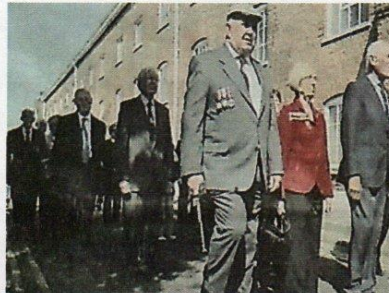
Members marching to Saint Ann's